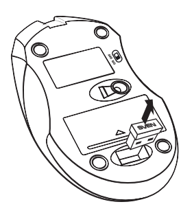
Fig. 5. Extraction of the receiver from the mouse case